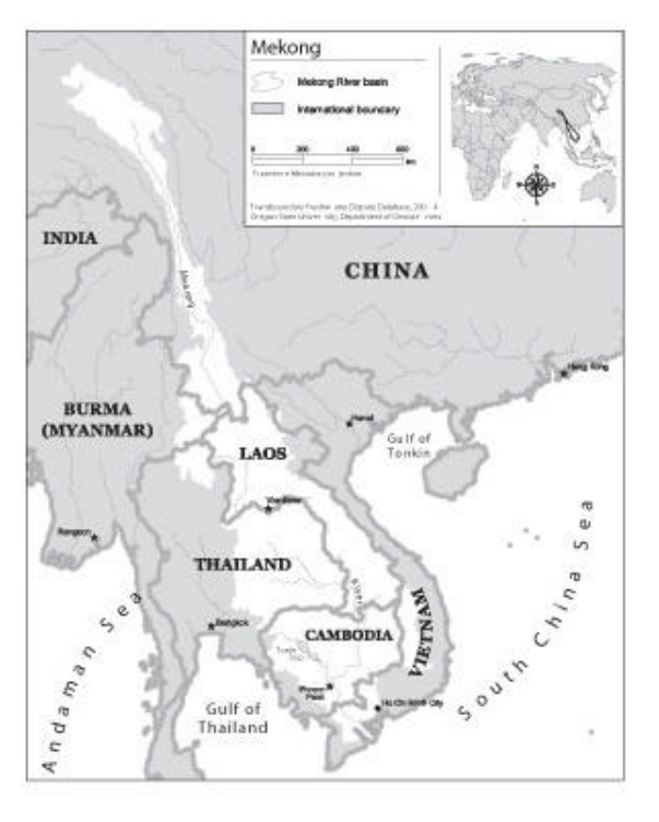
Figure 1: Map of the Mekong River Basin (TFDD, 2007).